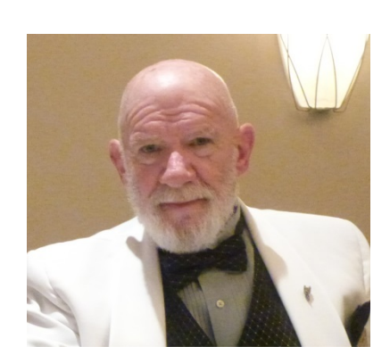
From the Supreme Secretary's Desk